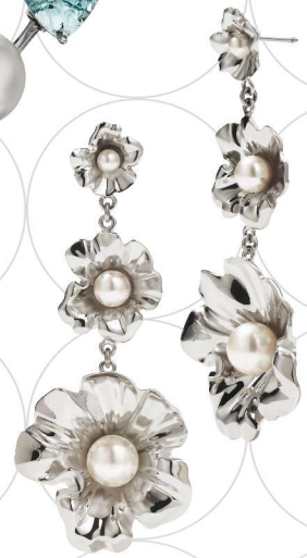
Clockwise from top left: Slim Slide Pearly Cross clutch from Judith Leiber ($4,195; judithleiber.com). Celeste layered ear jacket from Ananya with pearls, diamonds, pink sapphires and pink tourmaline cabochons (price upon request; ananya.com). Bibi van der Velden Baroque pearl Star earrings ($2,500; bibivandervelden.com). Coral pearl drop earrings from Meadowlark ($859; meadowlarkjewellery.com). Mastoloni Bright Lights earrings ($2,288; mastoloni.com). Alex Solider Gold Twist earrings ($16,500; alexsolider.com). GFG Jewelry by Nilufer Eline pearl earrings with Gemfields emeralds and diamonds ($1,705; musexmuse.com). Assael 18" South Sea pearl and aquamarine necklace (price upon request; assael.com). Irene Neuwirth South Sea pearl Curved Tile Link bracelet ($29,940; irenenuwirth.com).