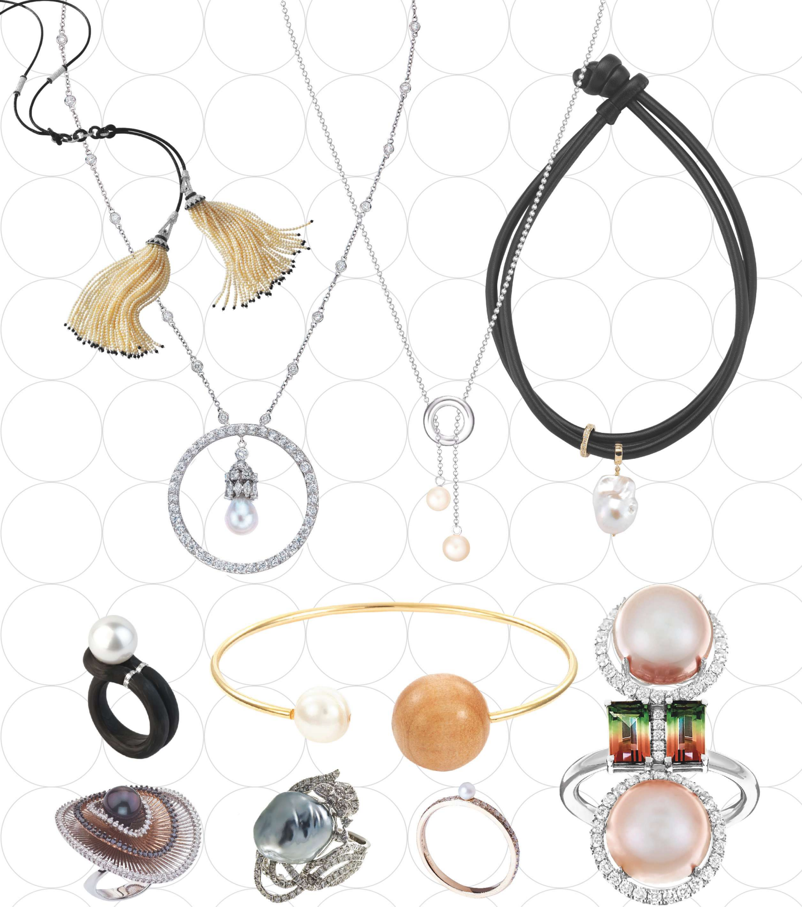
Clockwise from top left: Art Deco-style sautoir on a black cord with double pearl tassels, onyx and pavé set diamond embellishment from Stephen Silver Fine Jewelry ($85,000; shsilver.com). Mindi Mond diamond pendant with floating pearl ($25,000; mindimondny.com). Idole De Christoffe pearl and sterling silver lariat necklace ($710; christoffe.com). Mizuki Jewels leather collection diamond band and baroque white pearl bracelet ($1,520; mizukijewels.com). Elle et Lui pink double pearl ring from Nadine Aysoy ($7,800; nadineaysoy.com). Anissa Kermiche Perle Rare Pavée ring ($815; anissakermiche.com). CIRARI Baroque pearl and diamond ring (price upon request; cirari.com). Sistine large Pearla ring from Bergamo ($8,195; bergio.com). Cappio Carbon fiber, diamond and pearl ring by Fabio Salini (price upon request; fabiosalini.it). Sophie Monet Pearl Point bracelet ($130; sophiemonetjewelry.com).